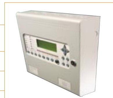
SYNCRO CONTROL PANEL