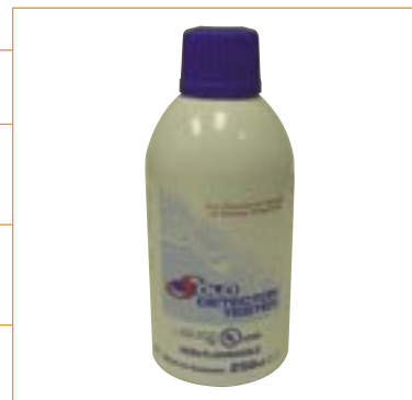
SOLO A7 SMOKE TESTER 250ML