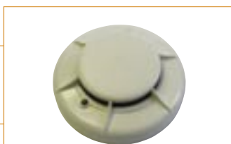
OPTICAL CONVENTIONAL DETECTOR