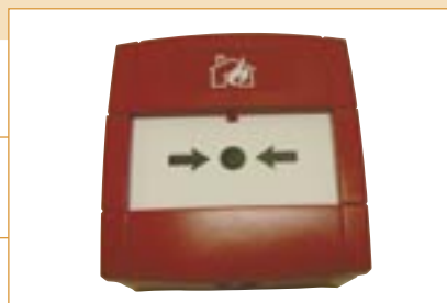
SURFACE CALL POINT WITH 470 OHM RESISTOR