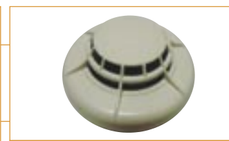
OPTICAL THERMAL MULTI CRITERIA CONVENTIONAL DETECTOR